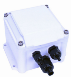
Optional Protective Cover Closed